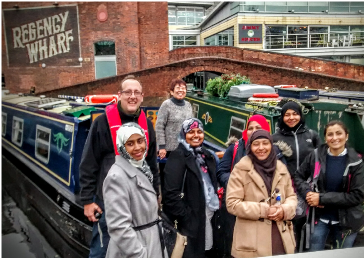
1Gas Street Mooring