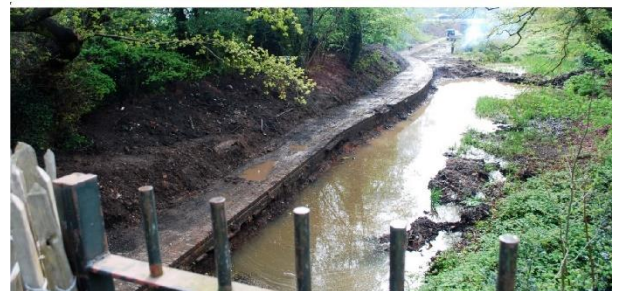
Working in Harborne Wharf